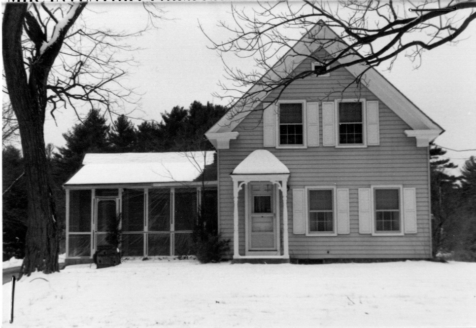
189 Pond St. (HPK.488)