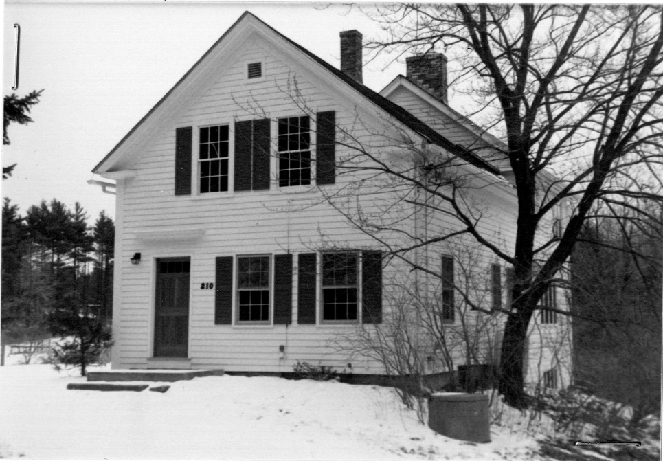
210 Pond St. (HPK.490)