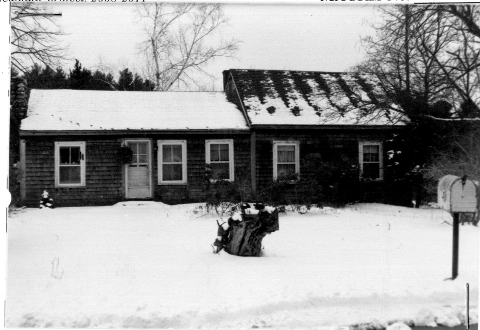
183 Pond St.